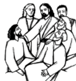
Calling the Twelve to him, he sent them out two by two.